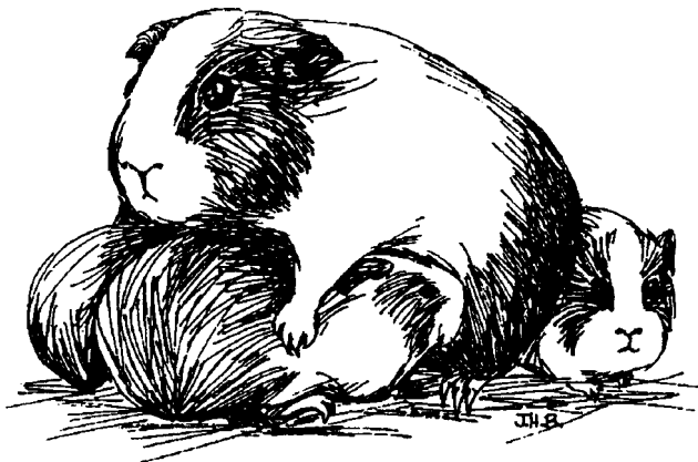
A Mother with Three Babies

You may want to give your cavy a bath occasionally. Please, make sure that you dry him completely, if you do. A small hand held hair dryer works well for this purpose and you will find that your cavy will actually enjoy it!