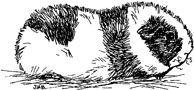
Broken Color Teddy

There are many misconceptions regarding cavy care and many pets could enjoy a much better life if their owners understood more about their needs. This pamphlet has been designed to help new cavy owners provide good care for their pets so each can enjoy a long and loving relationship.